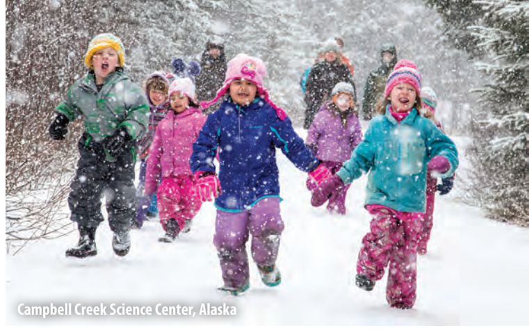
Campbell Creek Science Center, Alaska